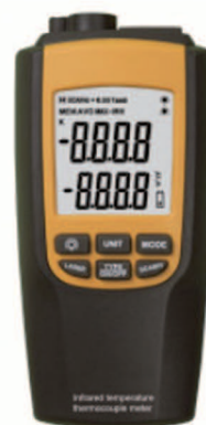
VA8090 Infrared temperature and thermocouple meter