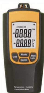
VA8010 Temperature /humidity and dew point meter