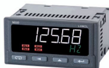
N32O Programmable digital meter of pulses, frequency, rotational speed - N32O