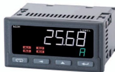
N32H Digital meter of DC circuit parameters