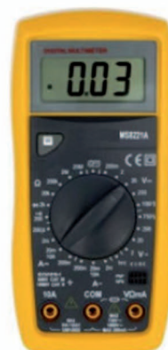
MS8221A Pocket size digital multimeter