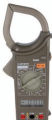
M266C Clamp meter