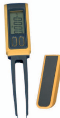
VA503 Pen R/C meter for SMD