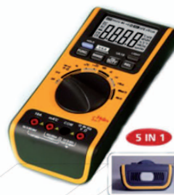
VA19 5 in 1 Digital multimeter