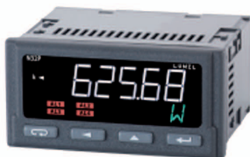
N32P 1-phase power network meter