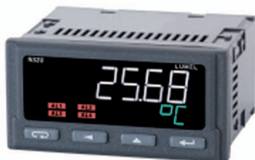
N32U Programmable digital meter of temperature, resistance and standard signals