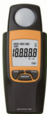
VA8051 Luxmeter with sensor rotation