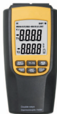
VA8060 Dual ways thermocouple meter